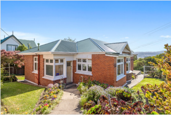
46 Highcliff Rd, Andersons Bay