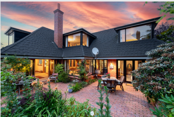
5 Burwood Ave, Maori Hill