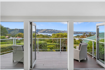
706 Highgate, Maori Hill