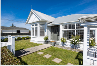
39 Douglas St, St Kilda

A selection of properties sold with great results for my clients