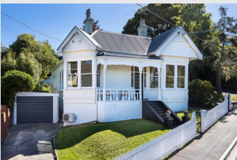
44 Leven St, Roslyn