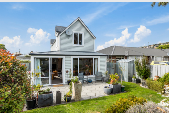
41b Eastbourne St, Caversham