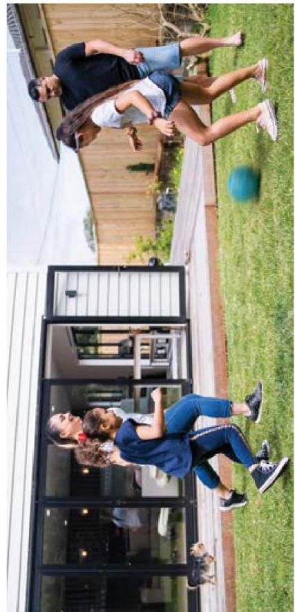
New Zealand Residential Property Sale and Purchase Agreement Guide

A sale and purchase agreement provides certainty to both the buyer and the seller about what will happen when.